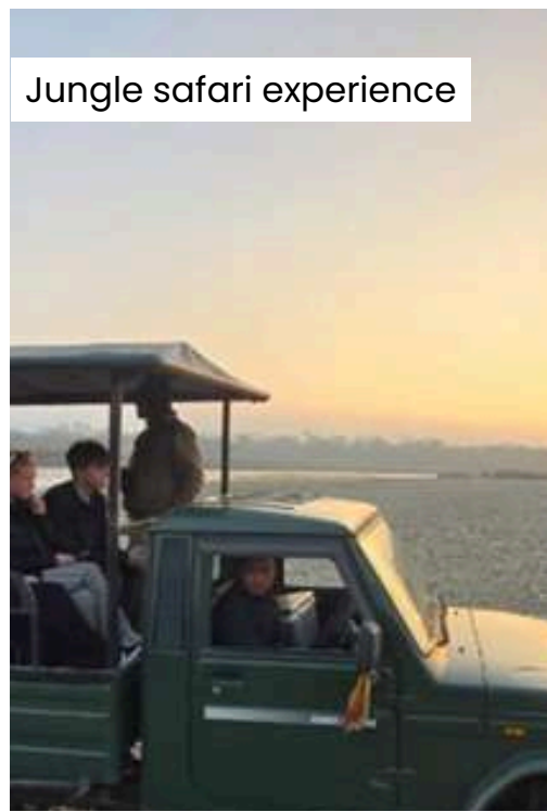
Jungle safari experience