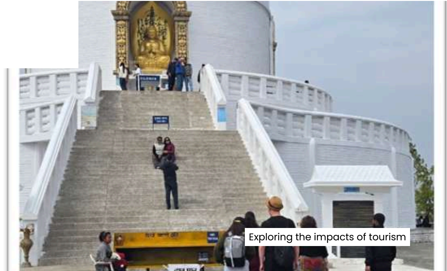
Exploring the impacts of tourism