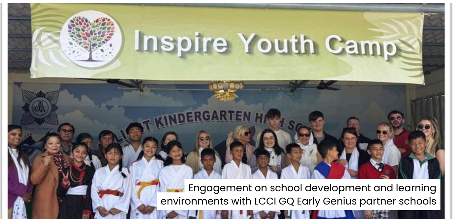
Engagement on school development and learning environments with LCCI GQ Early Genius partner schools