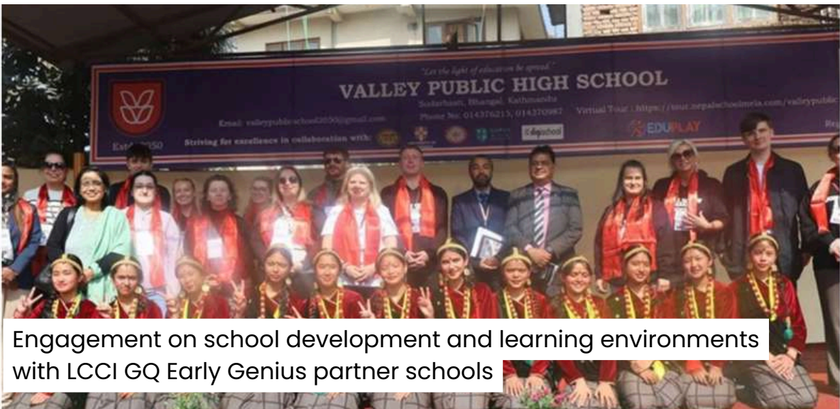
Engagement on school development and learning environments with LCCI GQ Early Genius partner schools