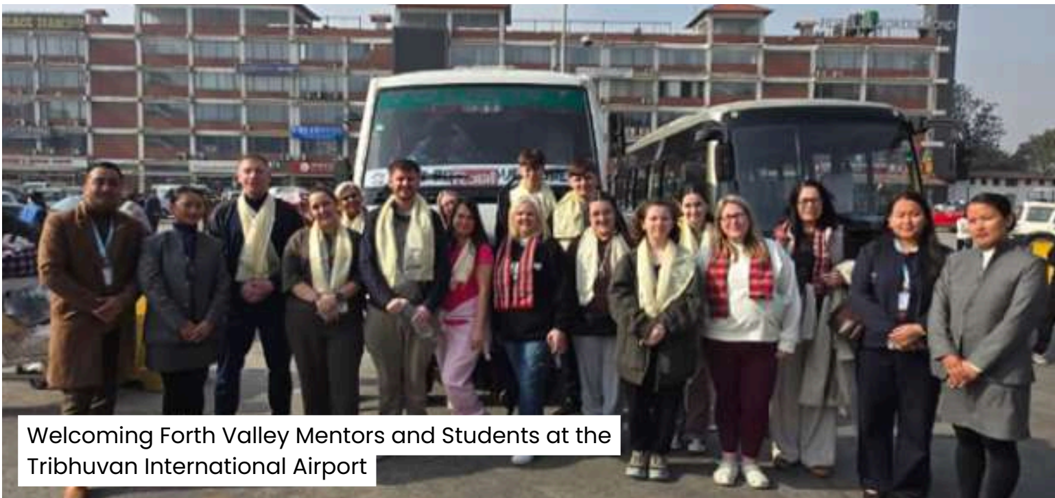
Welcoming Forth Valley Mentors and Students at the Tribhuvan International Airport