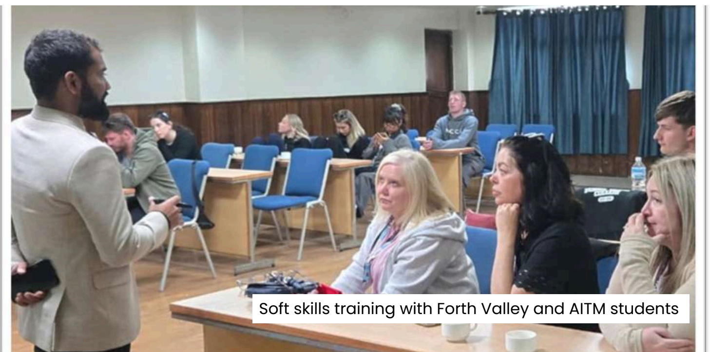
Soft skills training with Forth Valley and AITM students