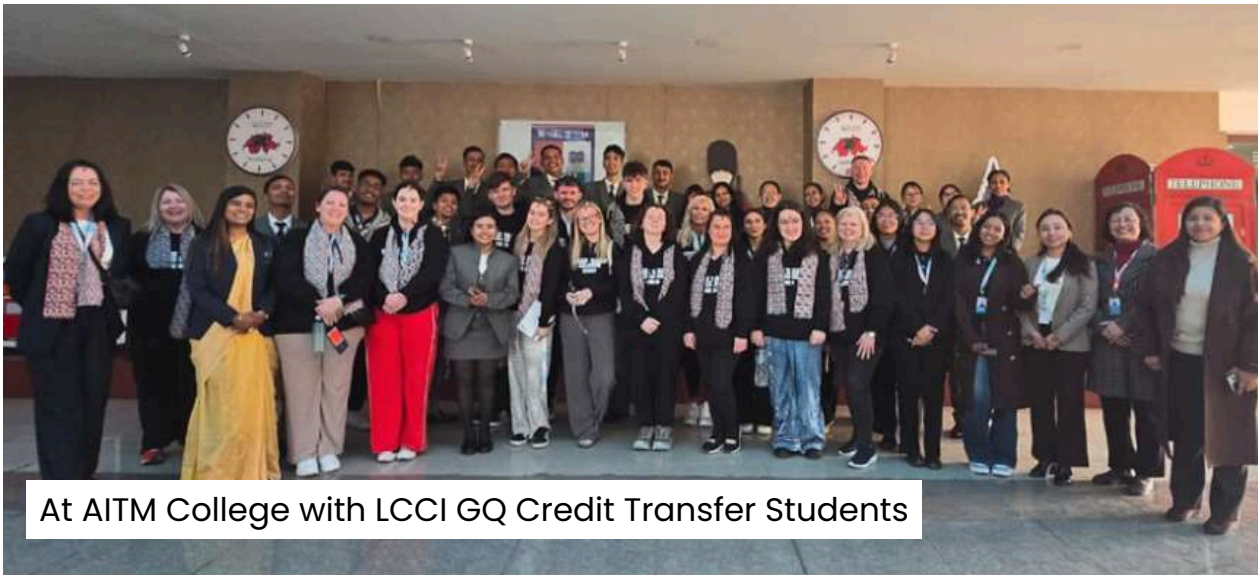
At AIMT College with LCCI GQ Credit Transfer Students