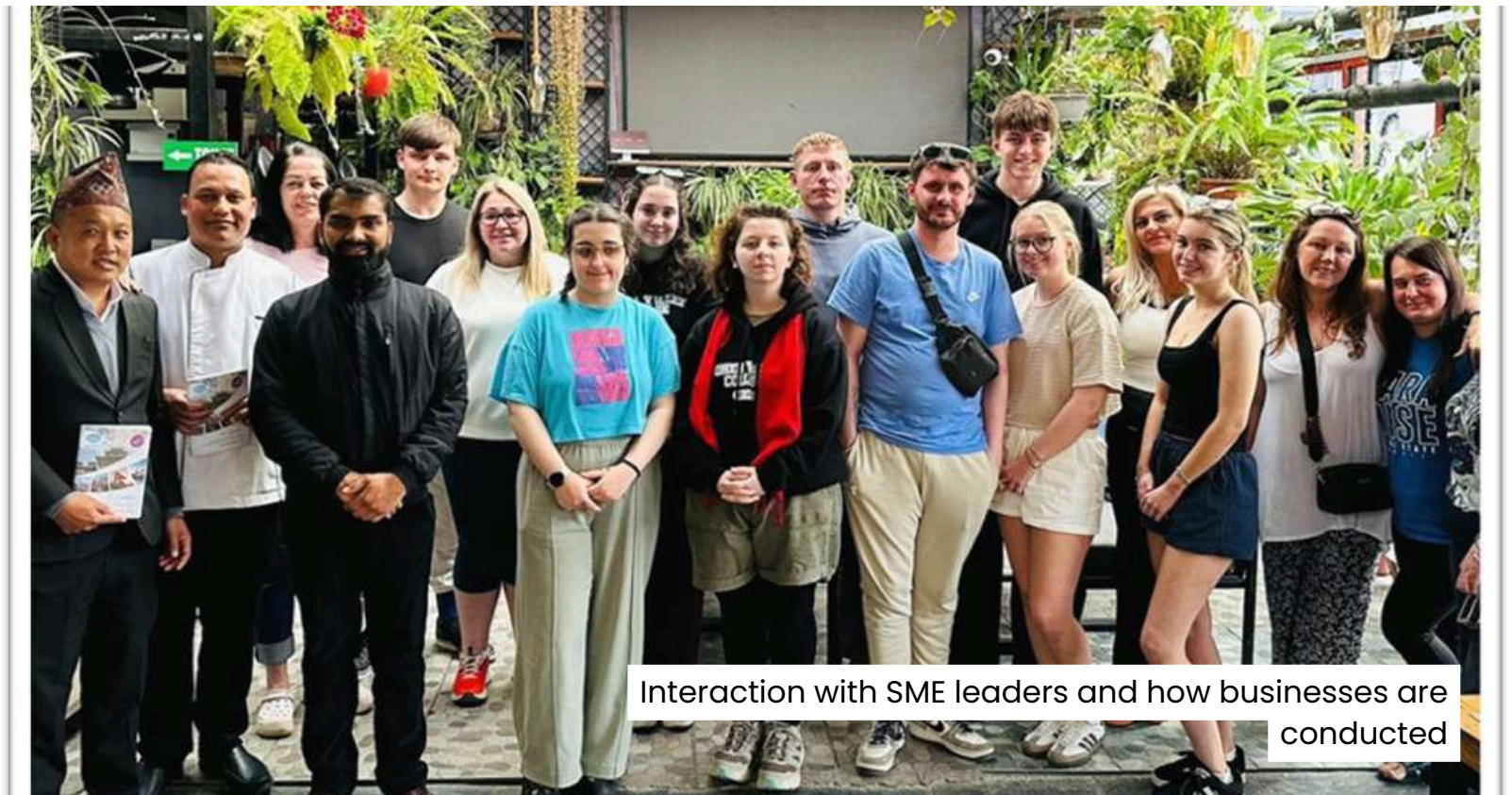
Interaction with SME leaders and how businesses are conducted