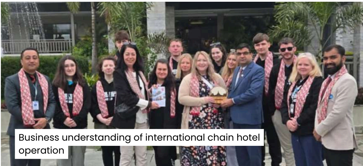
Business understanding of international chain hotel operation