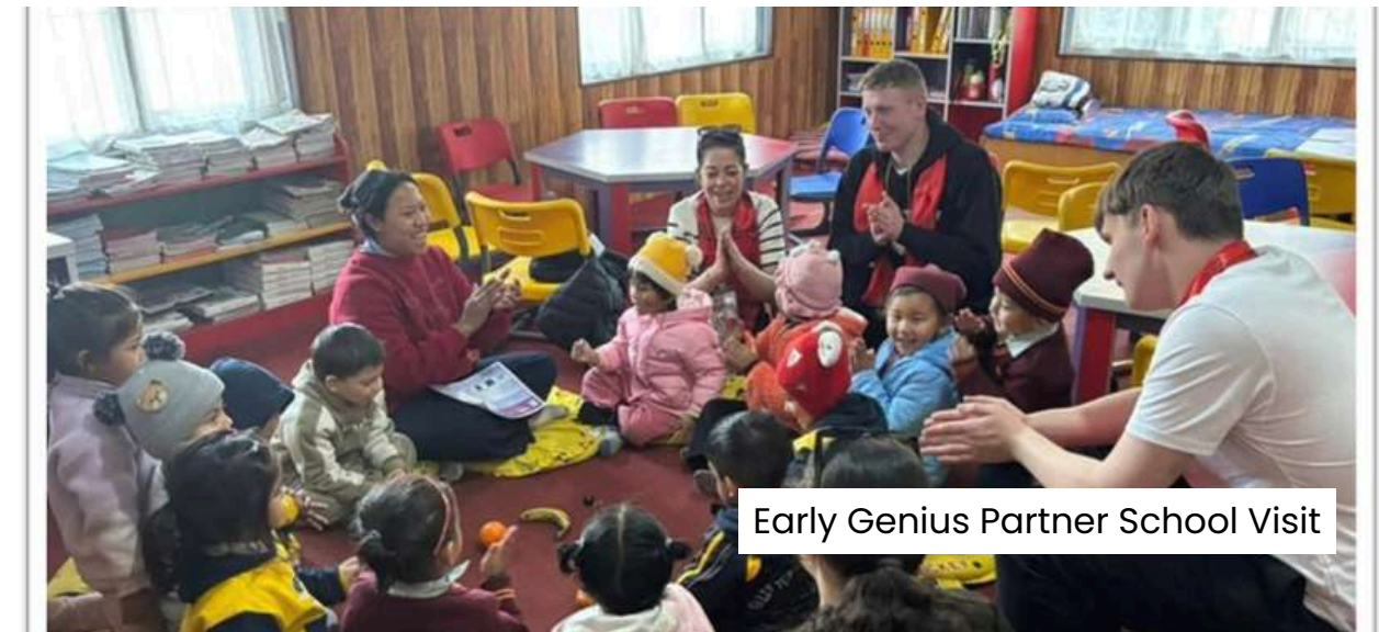
Early Genius Partner School Visit