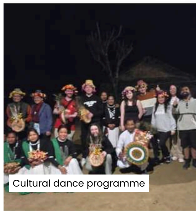
Cultural dance programme