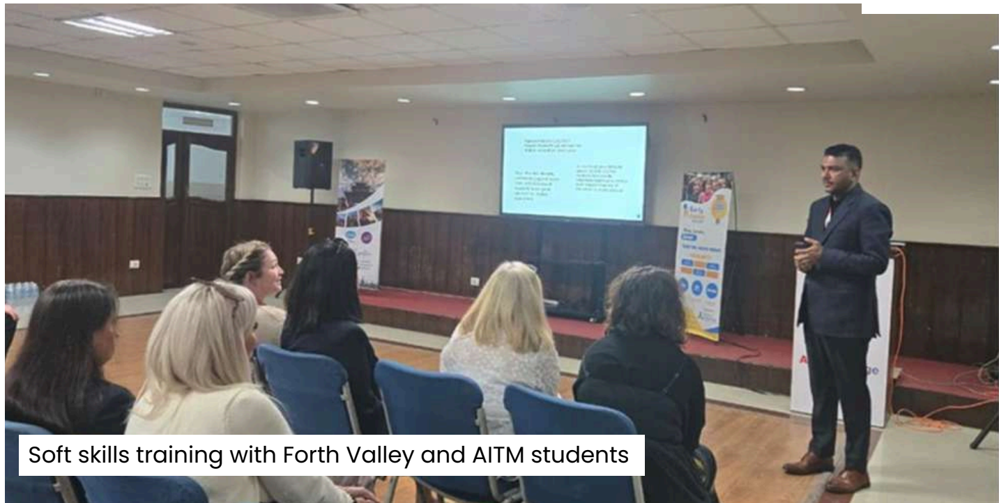
Soft skills training with Forth Valley and AITM students