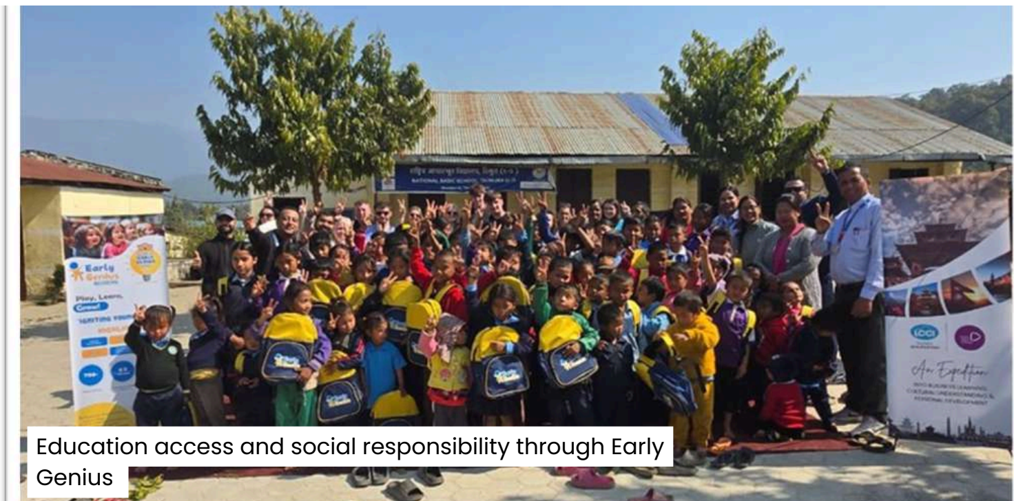
Education access and social responsibility through Early Genius