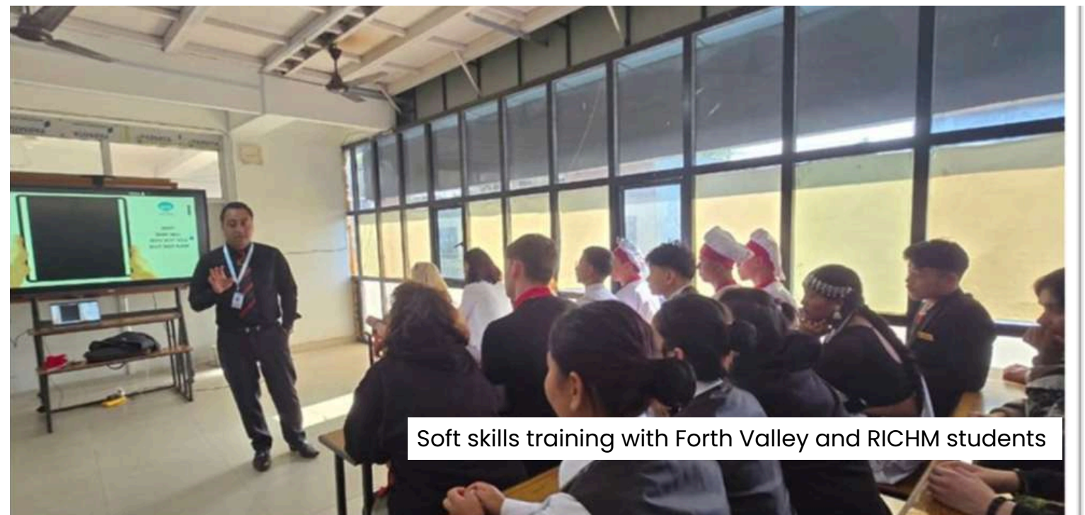
Soft skills training with Forth Valley and RICHM students