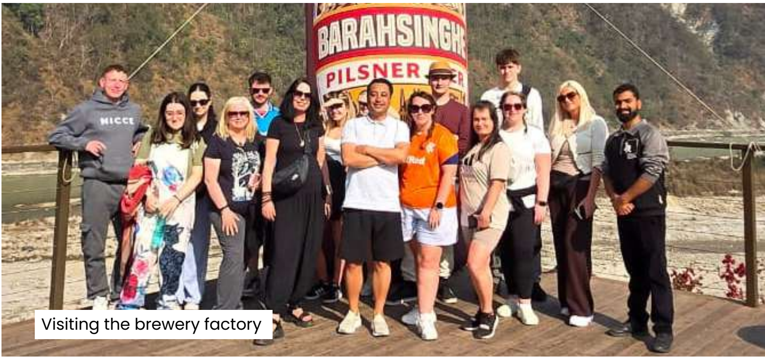
Visiting the brewery factory