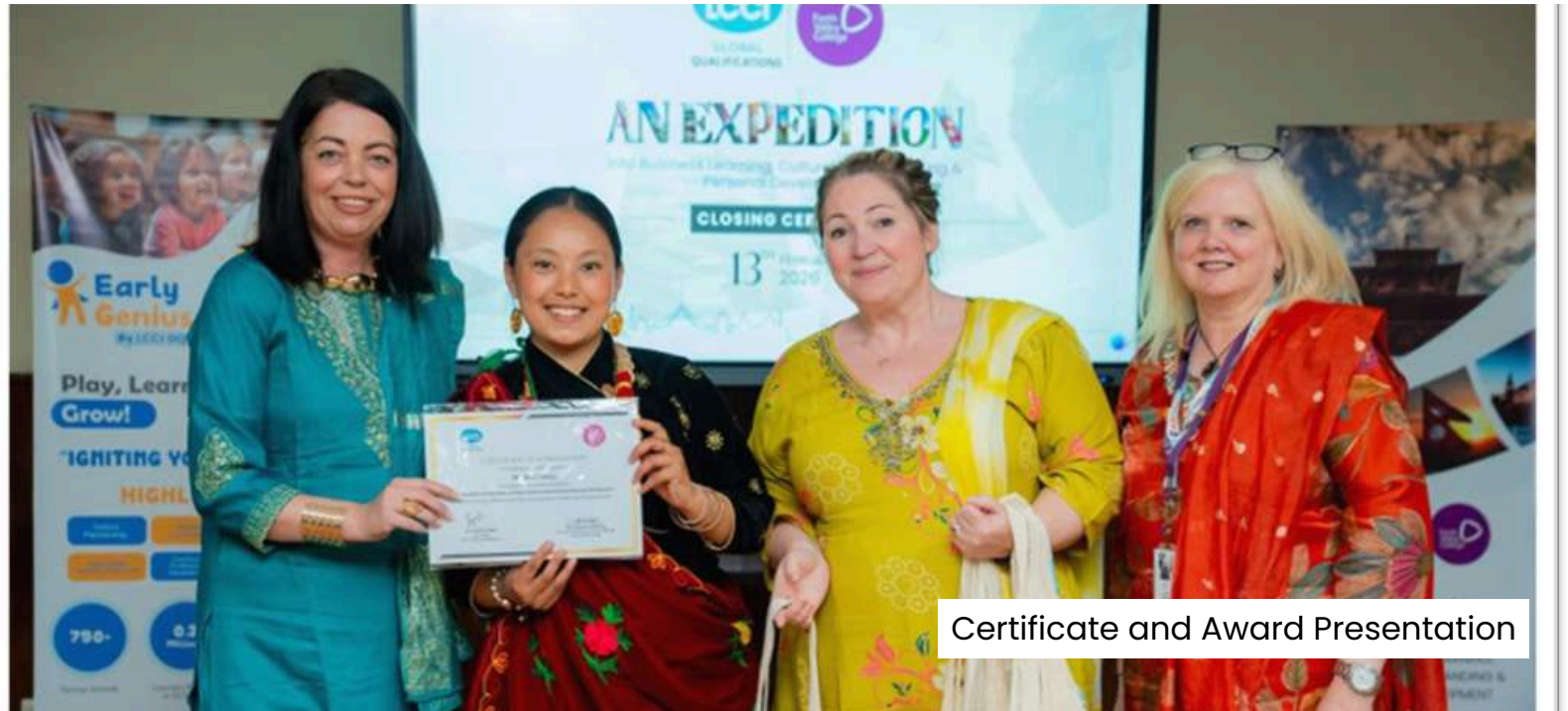
Certificate and Award Presentation