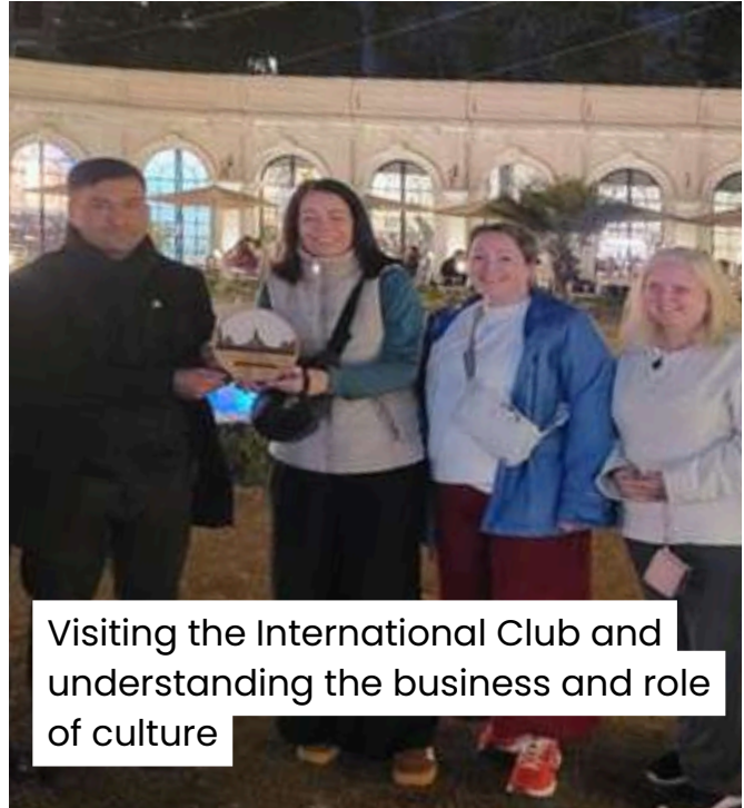
Visiting the International Club and understanding the business and role of culture