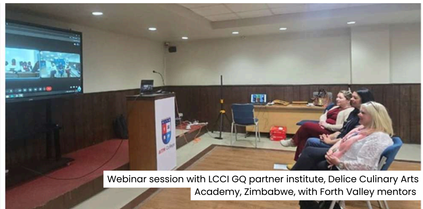
Webinar session with LCCI GQ partner institute, Delice Culinary Arts Academy, Zimbabwe, with Forth Valley mentors