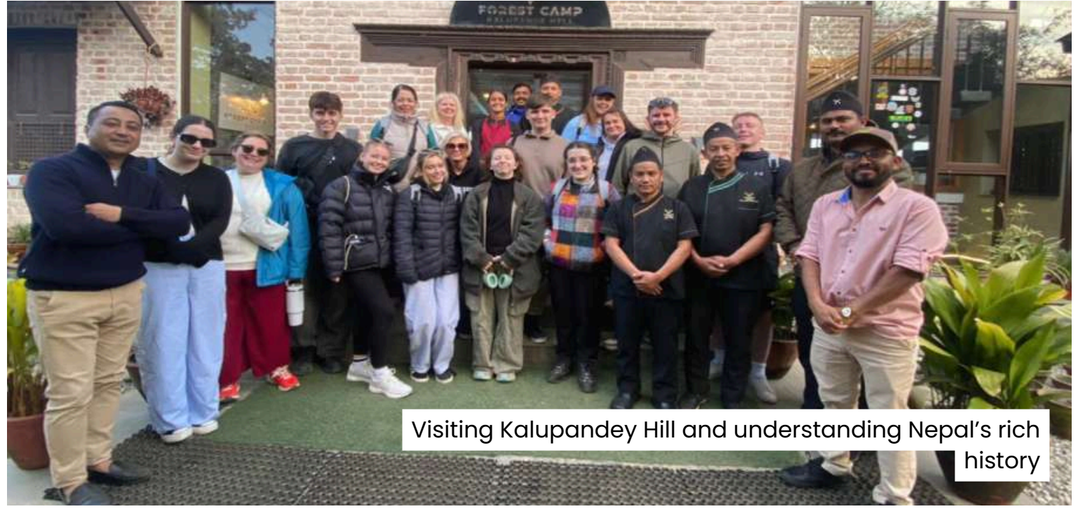
Visiting Kalupandey Hill and understanding Nepal's rich history