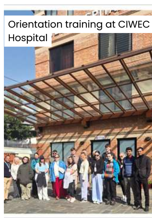
Orientation training at CIWEC Hospital