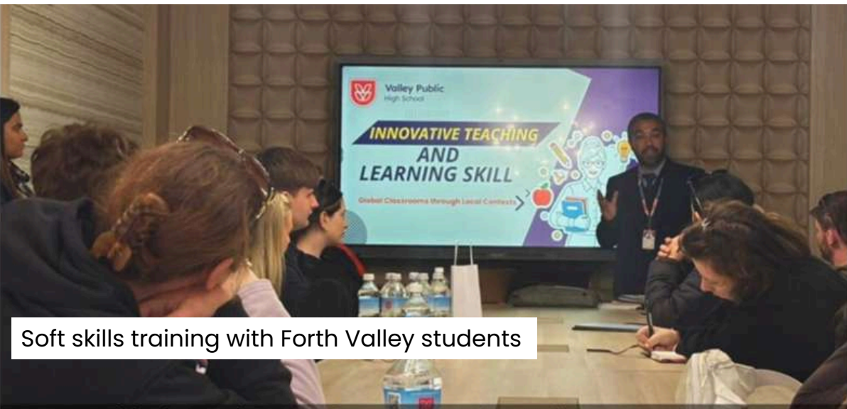
Soft skills training with Forth Valley students