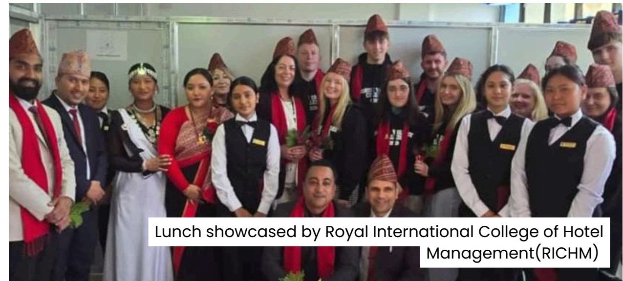
Lunch showcased by Royal International College of Hotel Management(RICHM)