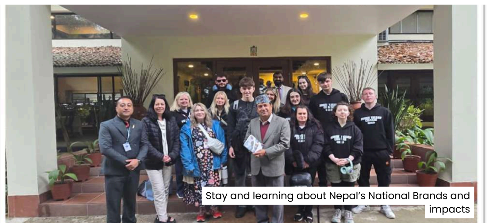
Stay and learning about Nepal's National Brands and impacts