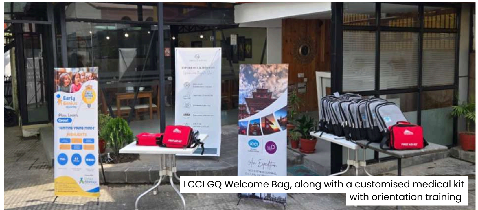
LCCI GQ Welcome Bag, along with a customised medical kit with orientation training