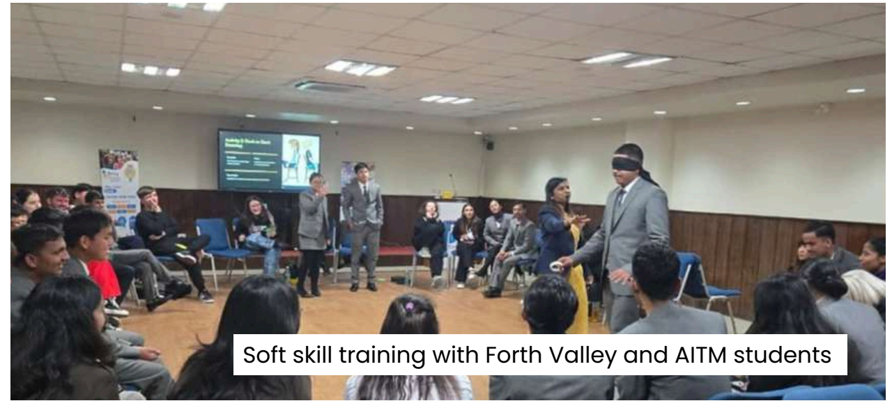
Soft skill training with Forth Valley and AIMT students