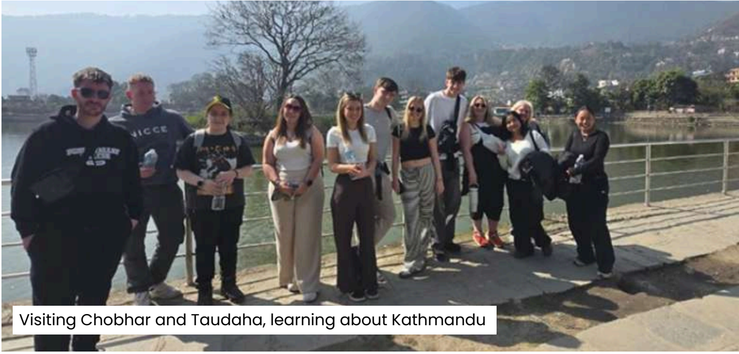
Visiting Chobhar and Taudaha, learning about Kathmandu